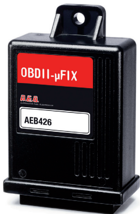
OBDII - \mu FIX EmulatorX